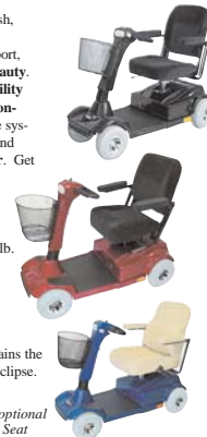
Shown with optional Admirals Seat

The 450 lb. capacity Eclipse Atlas adds a special reinforced frame with 21" wide seat (power seat optional), height, width and length adjustable armrests. Atlas retains the outstanding style, maneuverability, stability, transportability and comfort of the Eclipse.